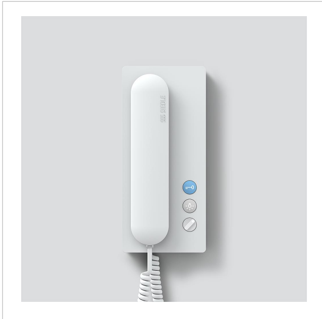
Standard in-house telephone HTS 811-0 W 200034360-00