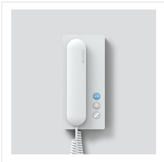
Standard in-house telephone HTS 811-0 W 200034360-00