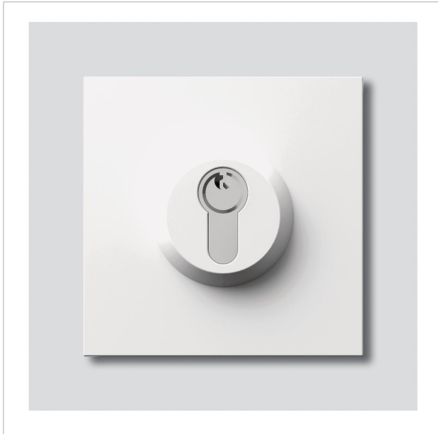
Lock module SM 611-01 W 200019404-01