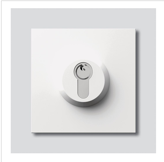
Lock module SM 611-01 W 200019404-01