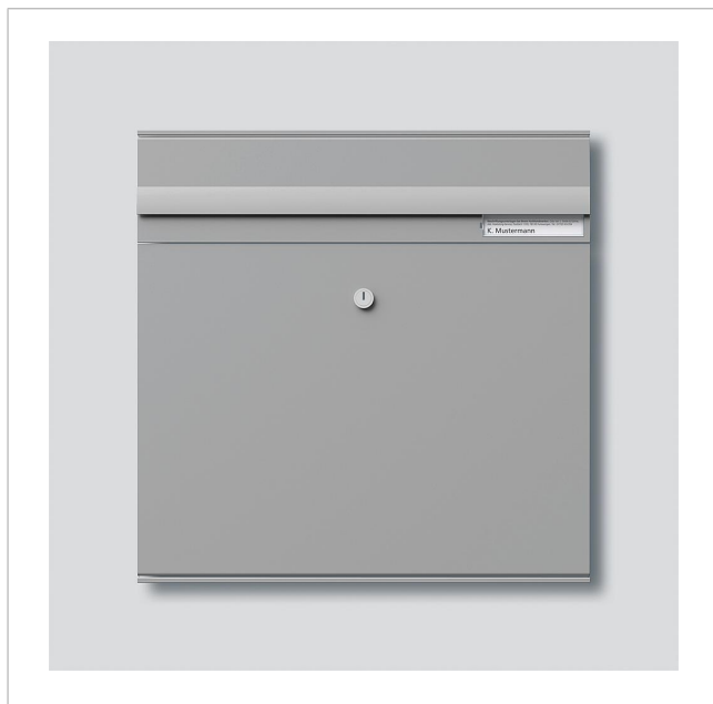
Letterbox module with pass-through flap BKM 611-4/4-0 TM