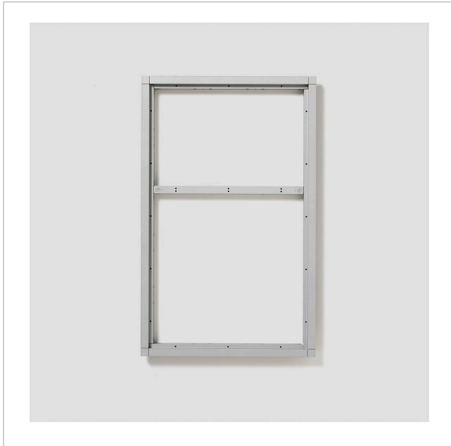
Combination frame KR 611-5/3-0 SM