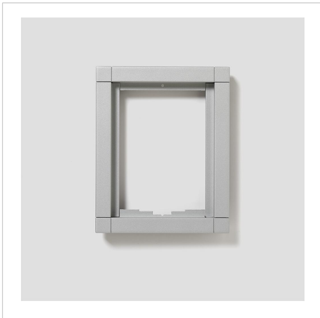
Combination frame KR 611-1/1-0 SM