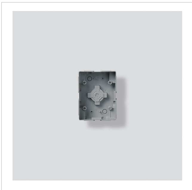
Flush-mount housing GU 611-1/1-0