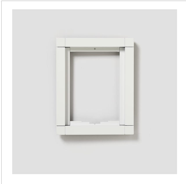
Combination frame KR 611-1/1-0 W