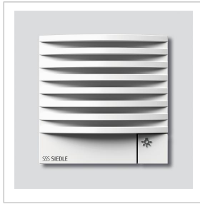
Bus door loudspeaker module Plus BTLM 651-0