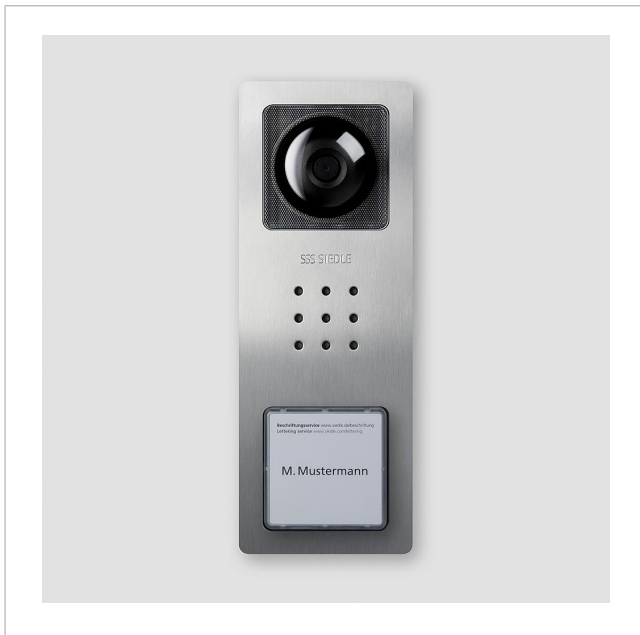
Siedle Compact video door station BCV 850-1-01 E 210008737-00