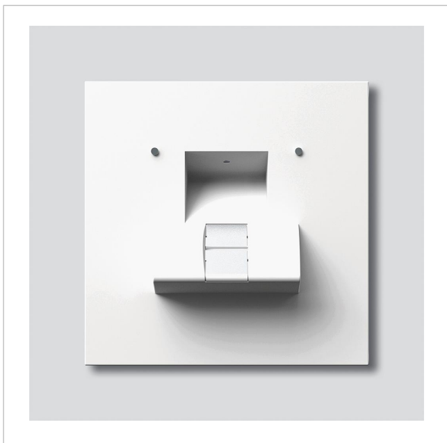
Fingerprint module FPM 600-0 W 210009607-00